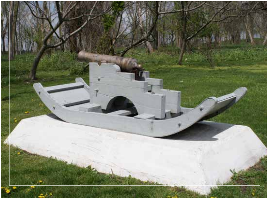
3 pound artillery piece mounted on sled.

The new millennium saw efforts to preserve and protect the battlefield grow significantly as local organization took an active role in the protection and restoration of the site. Through local efforts, land in and around the battlefield was purchased. The former River Raisin Paper Company was turned over to the city. In 2006, a special resource study to consider the inclusion of the River Raisin Battlefield as a national park system unit began. Site cleanup and land acquisition continued as the former paper mill was demolished and removed from the landscape. While work continued on the site, U.S. Representative John Dingell and Senator Carl Levin introduced legislation for the creation of the River Raisin National Battlefield Park, which was signed into law in March 2009. The establishing legislation for River Raisin National Battlefield Park allowed for the continued growth and development of the site as additional properties related to the battles (of January 18–22, 1813) may be donated to the park. In the future, River Raisin National Battlefield Park will continue to preserve, commemorate, and interpret the historic events and national sacrifices that took place on this battlefield during the War of 1812.