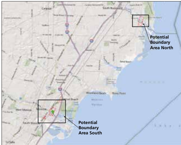
Area of Potential Boundary