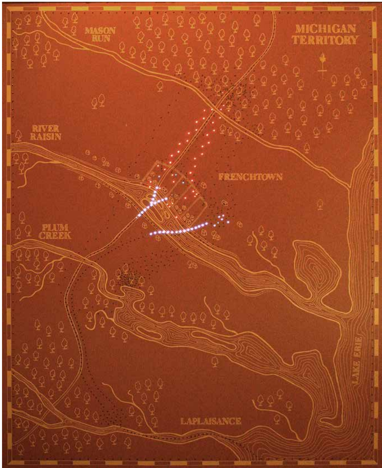
Interactive battlefield display.