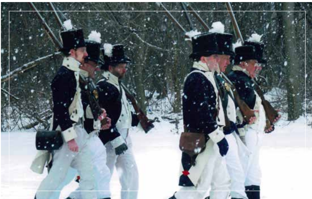
Commemorating the battles of the River Raisin.

After the American Revolutionary War, racial, economic, religious, ethnic, and cultural conflicts between the United States and First Nations in the Ohio Country escalated into a no compromises cultural war, where both sides attacked noncombatants and destroyed homes to drive out the larger enemy populations. The British, with their own agenda for the “Old Northwest Territory” (today the states of Ohio, Indiana, Illinois, Michigan, and Wisconsin, as well as the northeastern part of Minnesota), found allies in the tribes. The battles and related action that occurred on January 18 and 22, 1813, at Frenchtown on the River Raisin comprise a costly defeat for U.S. forces during the conflict. Approximately one of every five U.S. soldiers killed during the battles of the War of 1812 died at Frenchtown. The second battle at River Raisin was the last major victory of the intertribal alliance formed by the Shawnee leader, Tecumseh, and the warriors from the Wyandot, Sac and Fox, Pottawatomi, Odawa, and Ojibwa tribes.