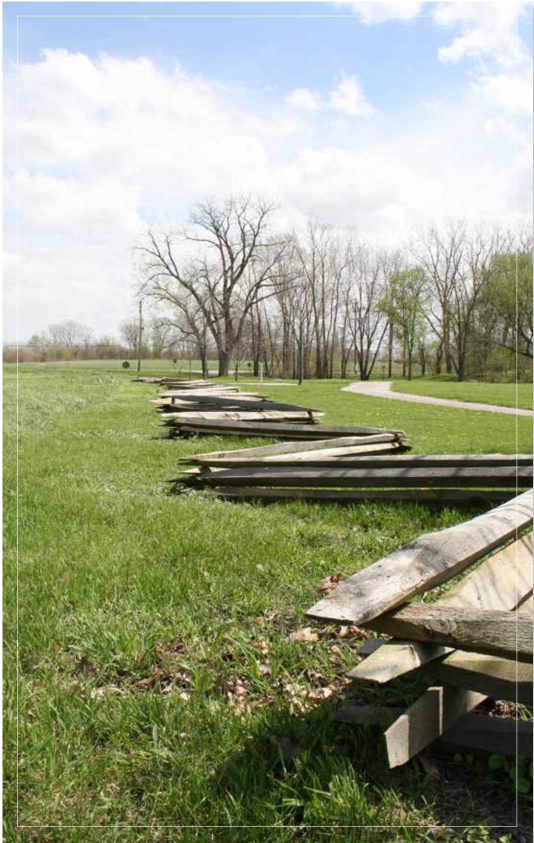
Battlefield skirmish line.