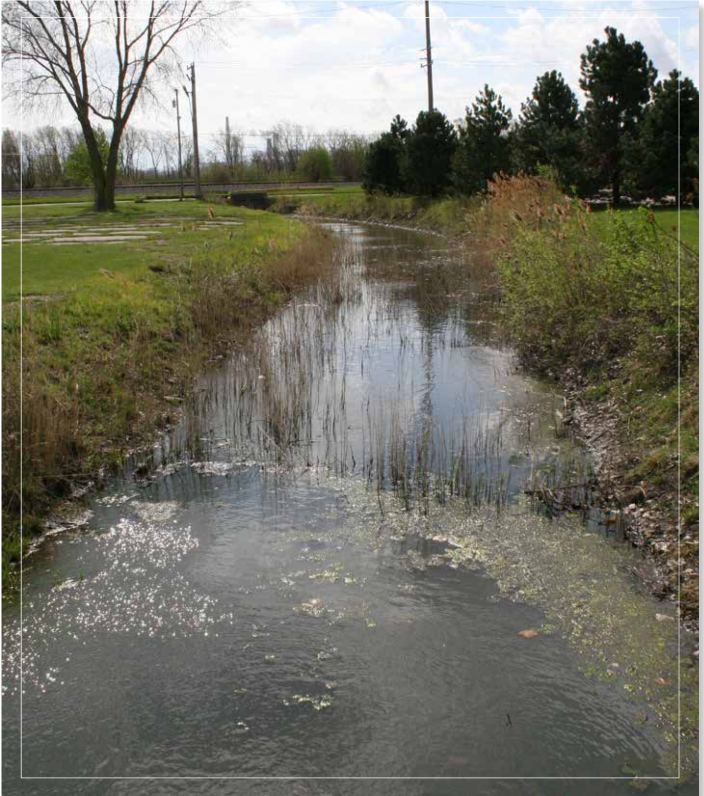
Mason Run.