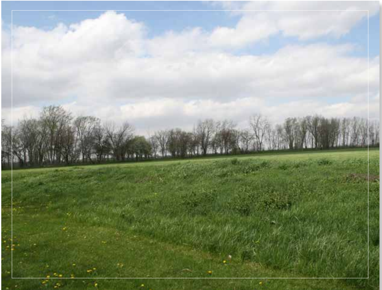
The River Raisin Battlefield landscape.