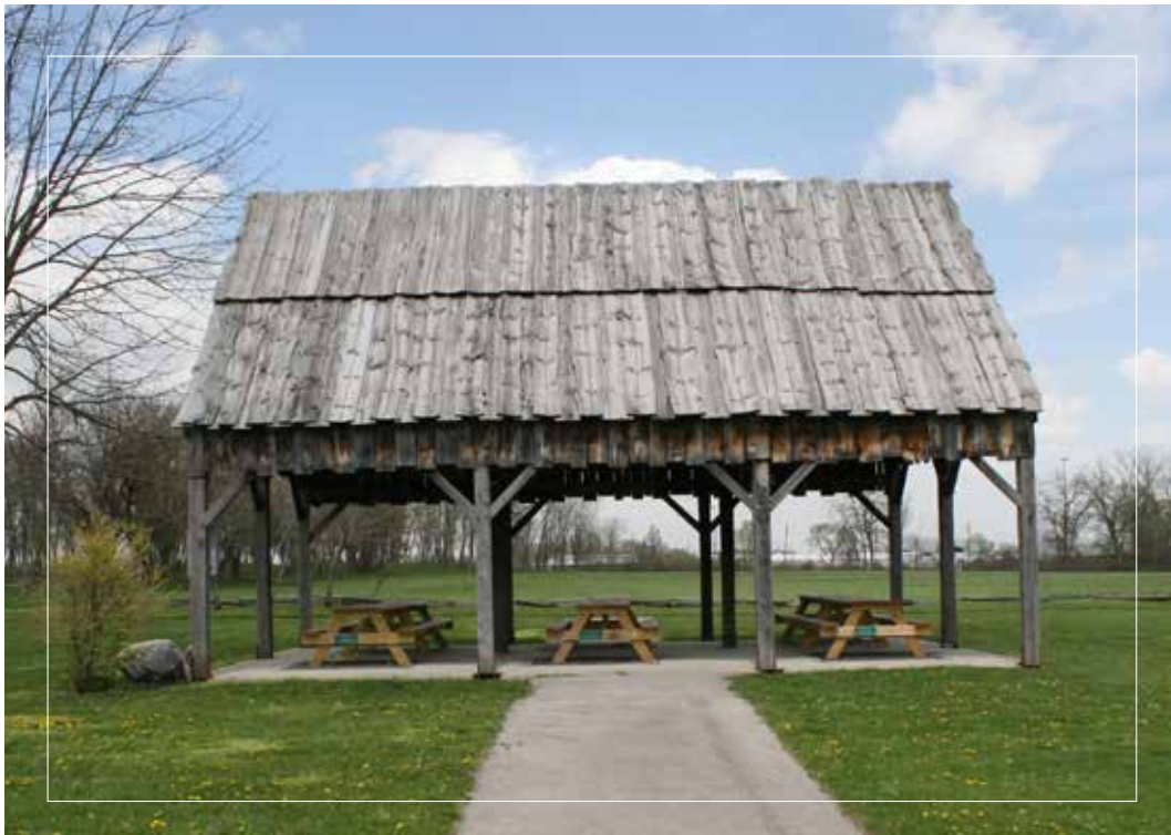
Picnic shelter at the park.

The identification of fundamental and other important resources and values should not be interpreted as meaning that some park resources are not important. This evaluation is made to separate those resources or values that are covered by NPS mandates and policies from those that have important considerations to be addressed in other planning processes.