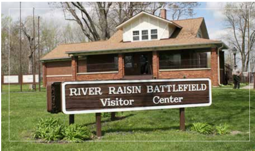
Visitor center.

At the time of the workshop, an agreement with River Raisin Foundation (a partner of the park) was being drafted.