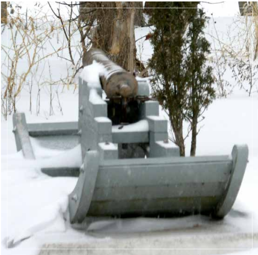
Sled cannon in winter.

A few key parkwide issues exist at River Raisin National Battlefield Park. Many of these issues are based on the relatively new nature of the park (established on October 12, 2010) and the need for baseline data through a historic resource study and cultural landscape survey. Key issues focused on land acquisition and park development strategies as well as long-range interpretive planning and visitor capacity concerns. Many of these parkwide issues are addressed elsewhere in the analysis of fundamental resources and values and identified planning and data needs.