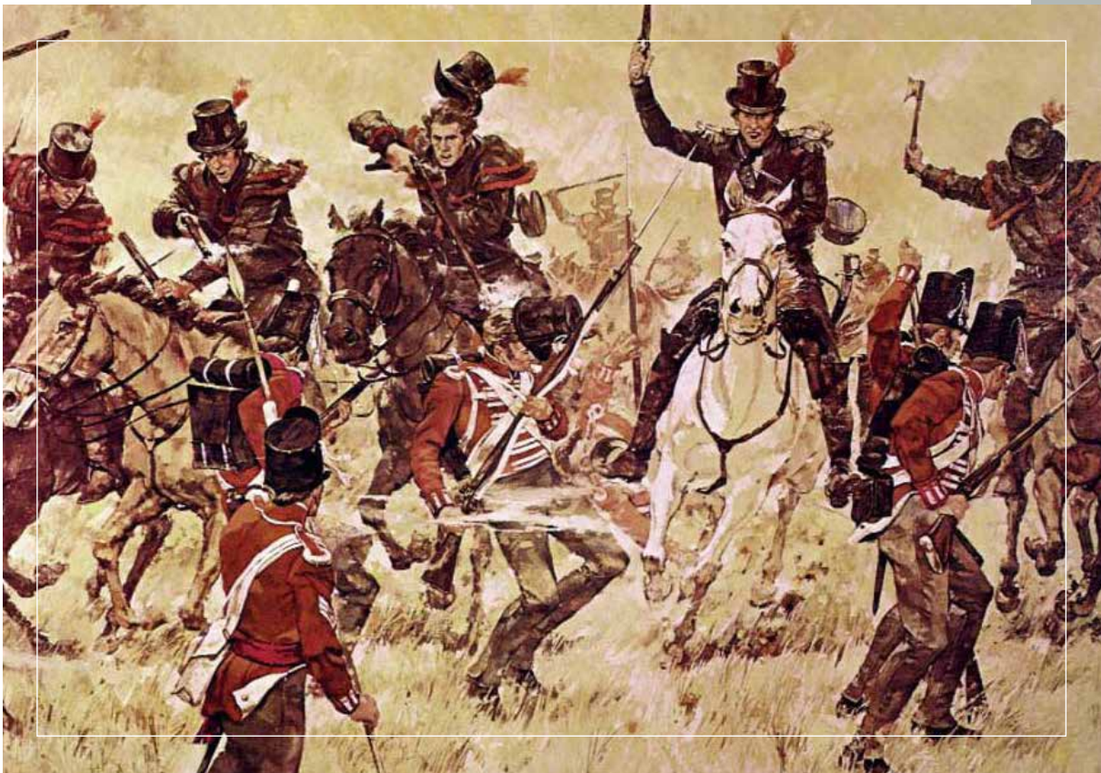
American militia confronting British soldiers.

River Raisin National Battlefield Park preserves, commemorates, and interprets the January 1813 battles of the War of 1812 and their aftermath.