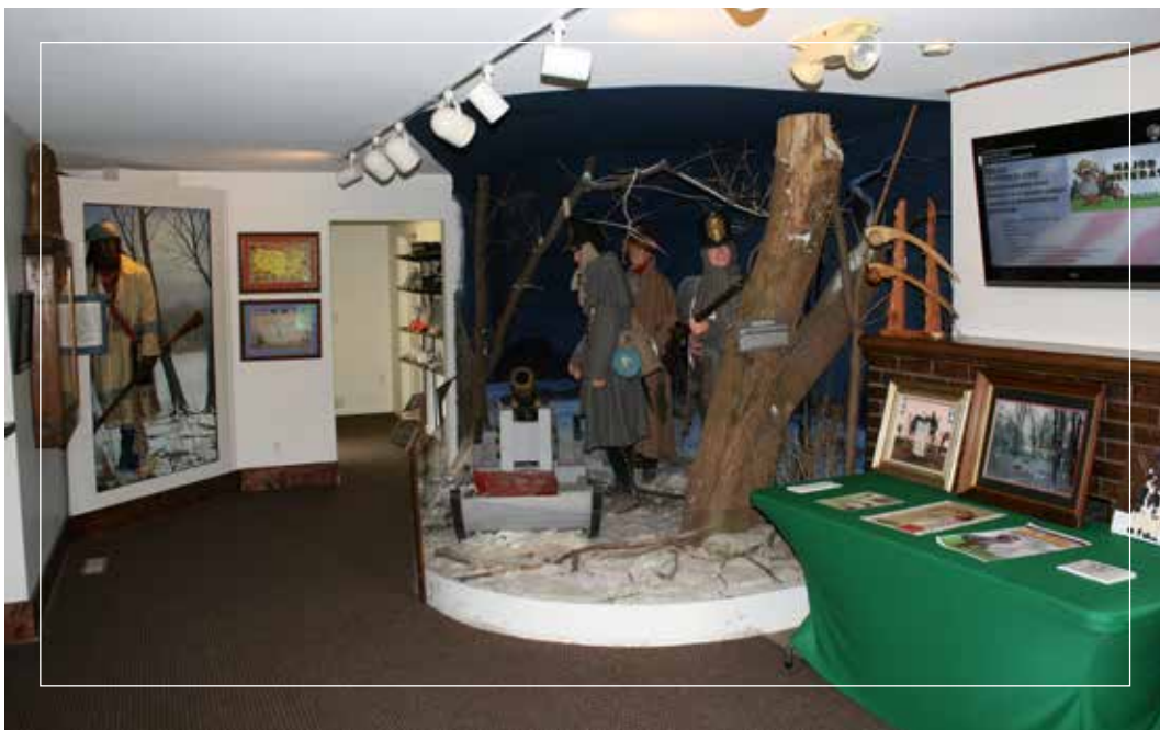
Displays at visitor center.