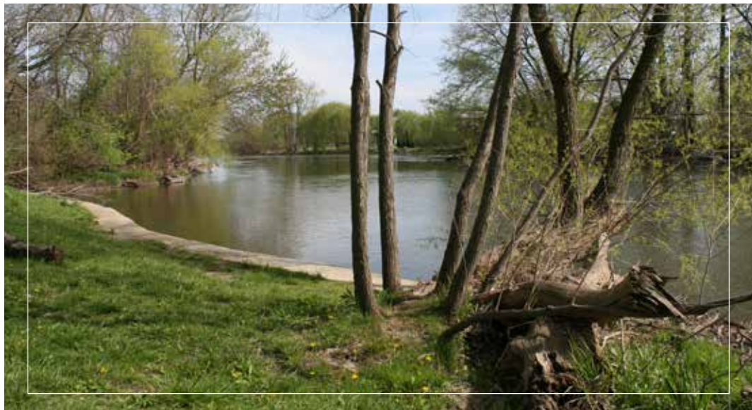
The River Raisin upstream from the battlefield.