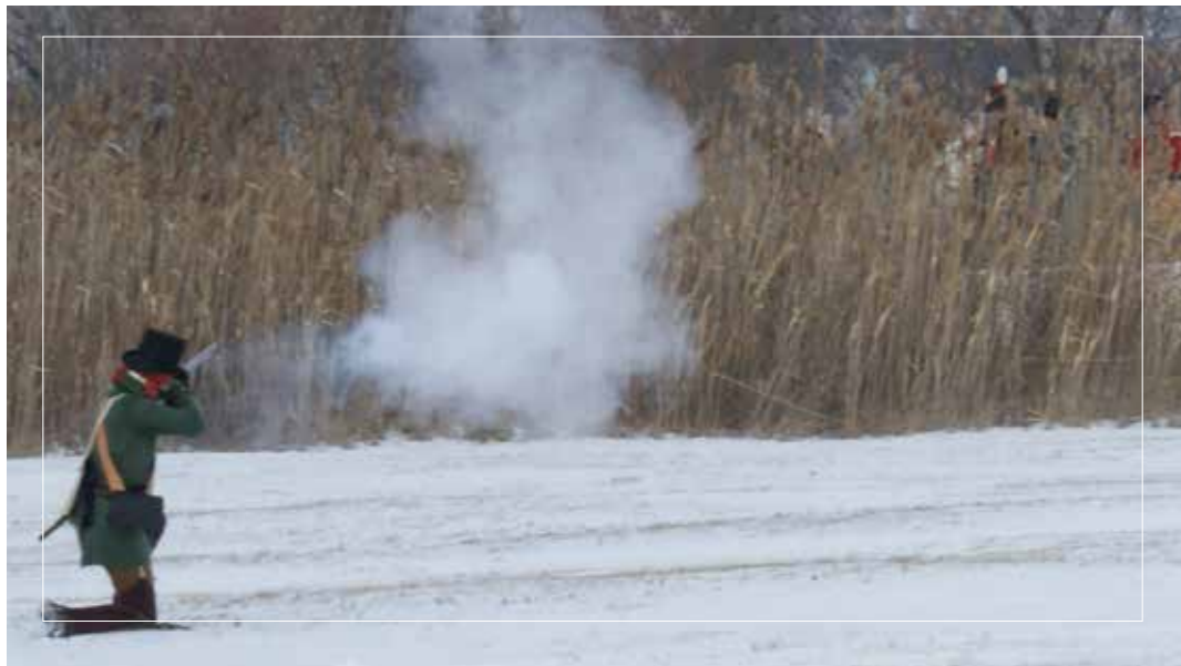
Musket firing demonstration.

Following the War of 1812, U.S. settlers flooded into the Michigan Territory. Frenchtown never fully recovered from the war as settlement in the region moved farther downriver to the town of Monroe, named in honor of President James Monroe’s visit in 1817. Over the next century, the Michigan Territory transformed from an outpost of territorial settlement to an industrialized state within the Great Lakes region. Monroe, with its location on the banks of the River Raisin, attracted numerous mills and factories to the region throughout the 20th century. In 1910, the River Raisin Paper Company was established and built its facilities on portions of the battlefield site. Despite this intrusion, the local community continued to “Remember the Raisin” by erecting monuments and markers that commemorated the site of the battles and sacrifices that took place on the banks of the River Raisin.