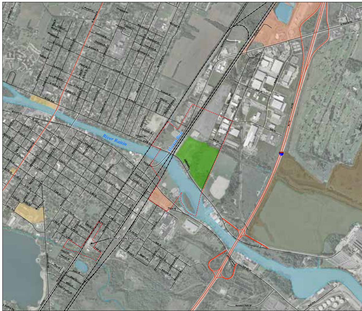
Potential Boundary Area South